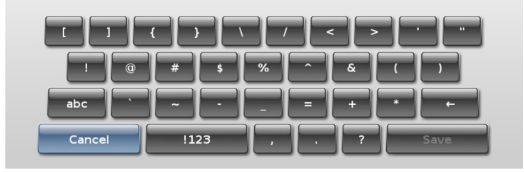
Touchscreen Keyboard (Numbers):

Touchscreen Keyboard (Special Characters):